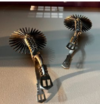
11/ Spurs Unknown Author