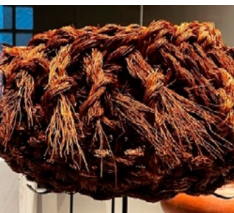
8/ Chicha basket Unknown author