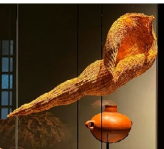
6/ Antihual Cecilia Chamorro

PONTIFICIA UNIVERSIDAD CATÓLICA DE CHILE