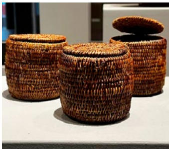
5/ Mutter from Tenglo