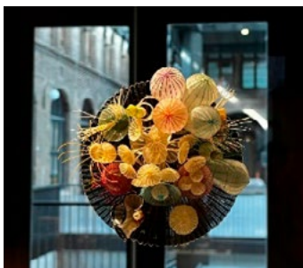
3/ Dream under the sea Hilda Díaz