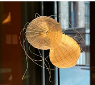
4/ Brooch Rita Soto